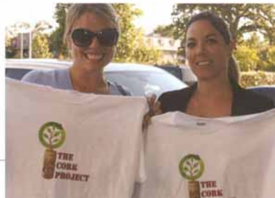
Below: cork participants with t-shirts